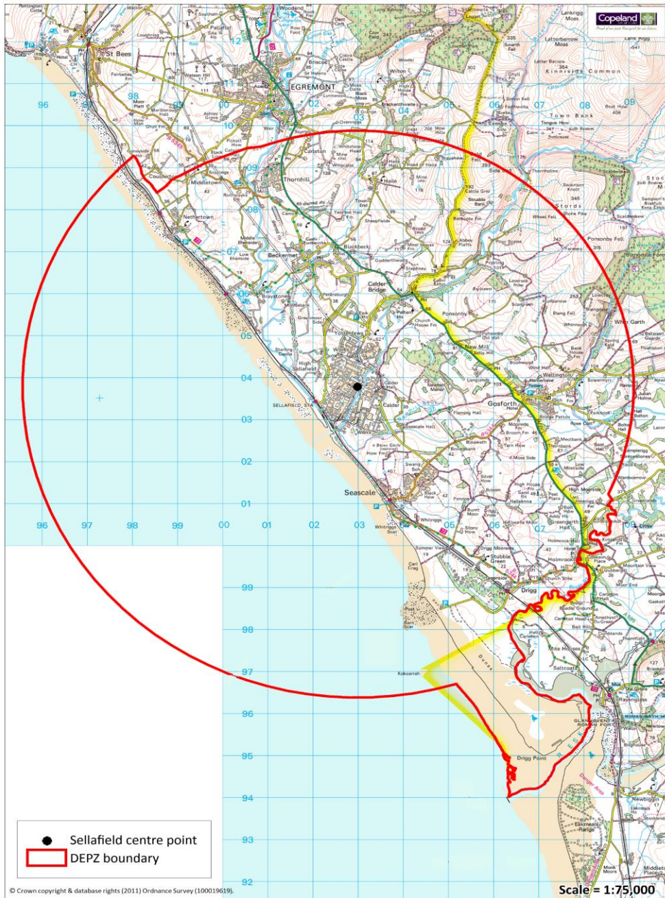
The new Detailed Emergency Planning Zone (DEPZ) for Sellafield as determined by the Office for Nuclear Regulation.